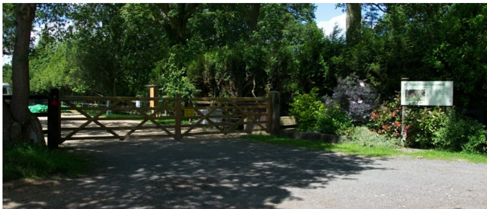
Two Hoots Campsite Entrance

Please do not turn in until you can see the Two Hoots Campsite sign. There are 2 private drives either end of the campsite entrance; our neighbours won't appreciate a visit however short. Thank you.